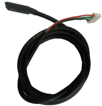
Fig. 1 Temperature & Humidity Sensor